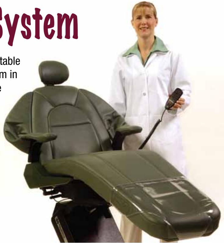
HealthCo Celebrity Plush Style with Relaxor System

Our Relaxor System will make your patients so comfortable they might not leave. We can install the Relaxor System in Most of our upholstery kits. Your patients will have the most comfortable dental visit ever.