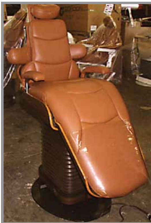
Chairman Plush with Ultraleather & Memory Foam

Since we make our kits to order, we can customize them to suit your needs. We can add sling or remove wings. We can add lumbar support or make a custom headrest.