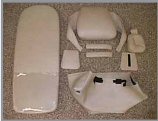
Royal 16 Kit - Seamless

Our kits are made by hand in our shop. Over the years we have developed patterns and scrutinized the details such as foam density and cushion style to make our upholstery truly superior.